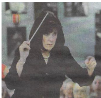
Richardson Senior Center