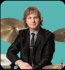
THE STOCKTON HELHING QUARTET